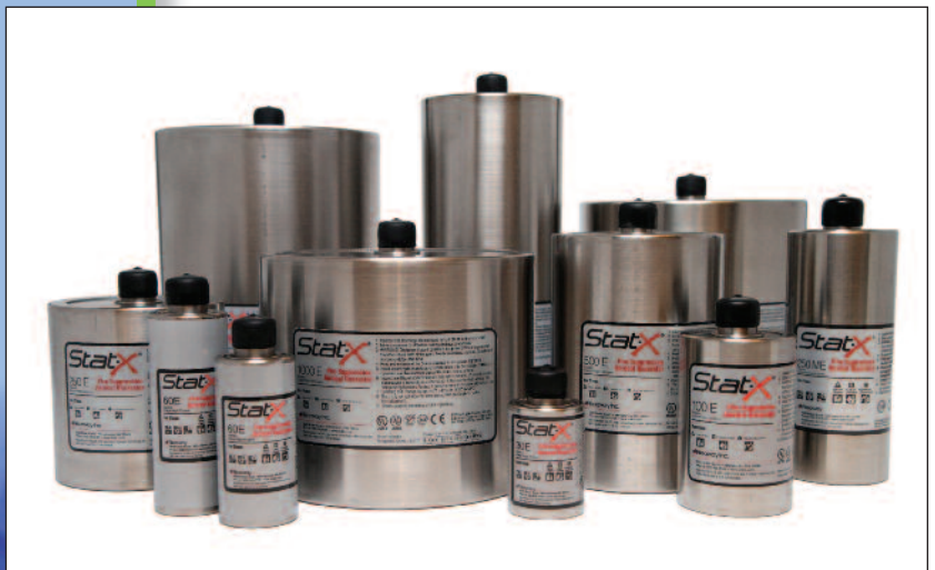
Stat-X® extinguishing units are compact and modular.

Hundreds of CNC machines throughout the world are being protected by Stat-X units. It's time you considered these for your machines!