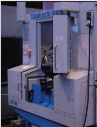
Stat-X fixed system protecting CNC machines with internally mounted aerosol unit.

Stat-X fire suppression systems are being used by hundreds of tools used by machine and tool and die shops throughout the world. This is a proven solution that can save you downtime, costly repairs, and greatly reduce the risk of human injury. To locate a distributor in your region, please call or email us, or visit our website at www.statx.com today!