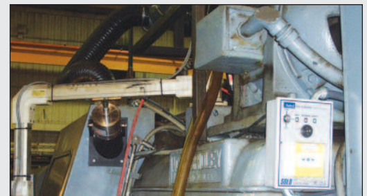
Stat-X automatic generators protecting CNC machine with an externally mounted aerosol unit.